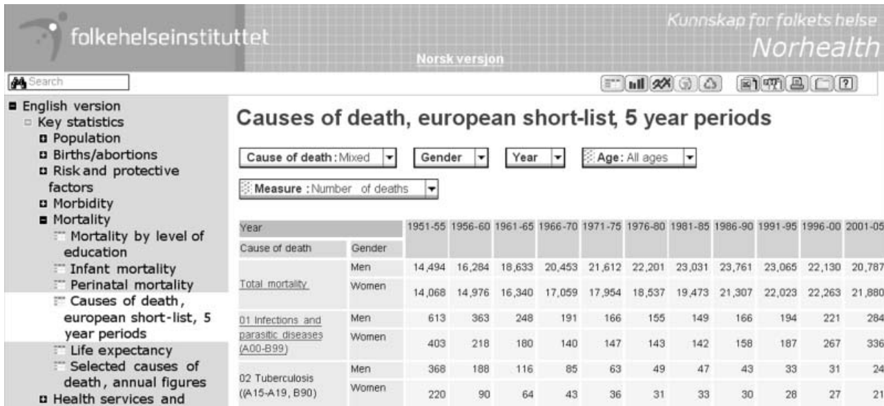
Figure 1. Default table view for a health indicator in Norhealth. Icons in the top right corner are used to switch to graphs, time series or maps. Created by Nesstar technology.

Norhealth presents health data primarily at the national and regional level. Municipality level health data is presented, also with use of Nesstar technology, by the Norwegian Directorate of Health ( http://nesstar.shdir.no/khp/ ). Other users of Nesstar technology are listed on their website ( http://www.nesstar.com/about/customers.html ).